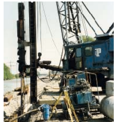
Diesel pile driver with a WOMA high-pressure waterjet system