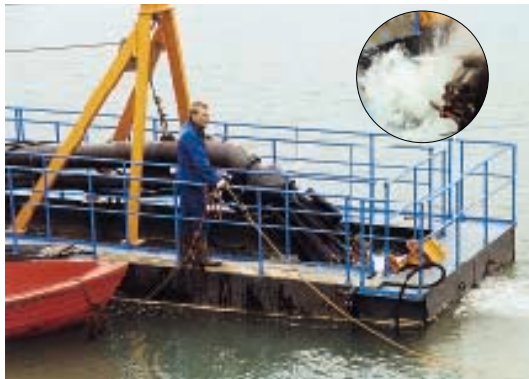
Waterjet system for pushing through clay layers in gravel pits