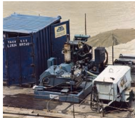
WOMA high-pressure plunger pump for waterjet assisted pile driving