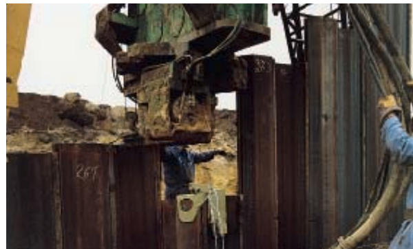
Pile elements at the Hamm-Dattel-Canal, driven with waterjet assistance