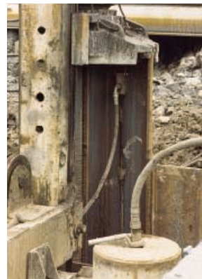
Piling element with mounted high-pressure lance and high-pressure hose