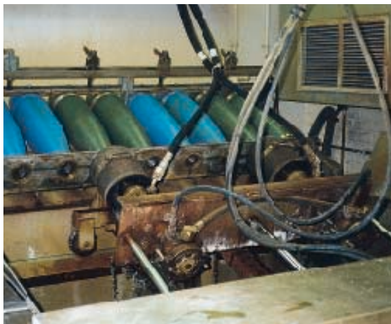
Explosive removal from shells