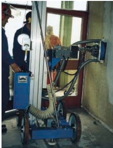
Emission-free removal of PCB-contaminated plasters