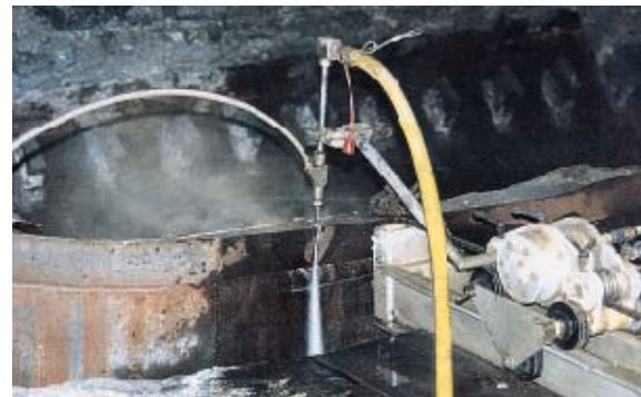
Demolition of a contaminated steel wall tank by abrasive water jets