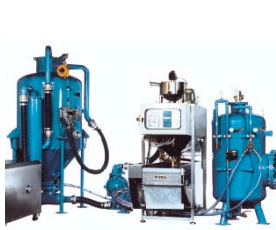
Modular treatment system for contaminated water