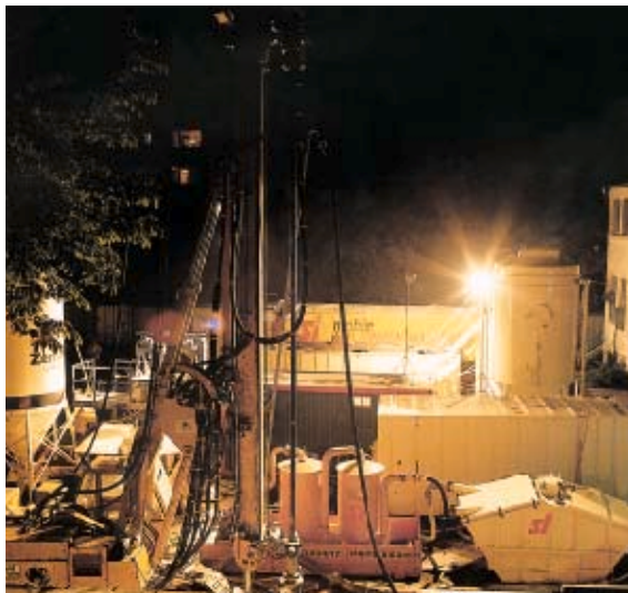
Decontamination of phenol-contaminated soil with WOMA's high-pressure technique