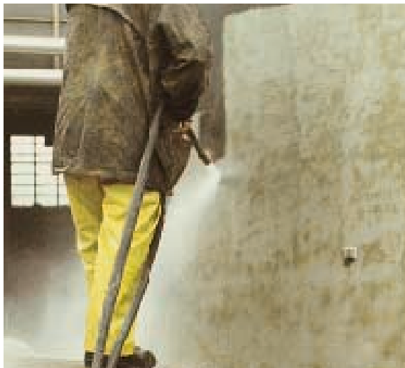
Chromium oxide removal from heat barriers of a nuclear power plant